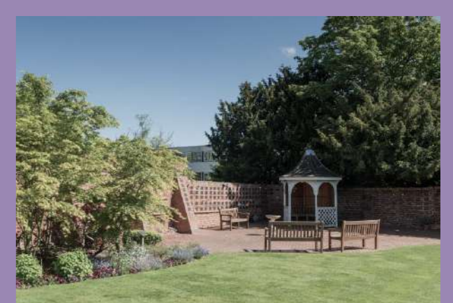
6 The Garden of Remembrance