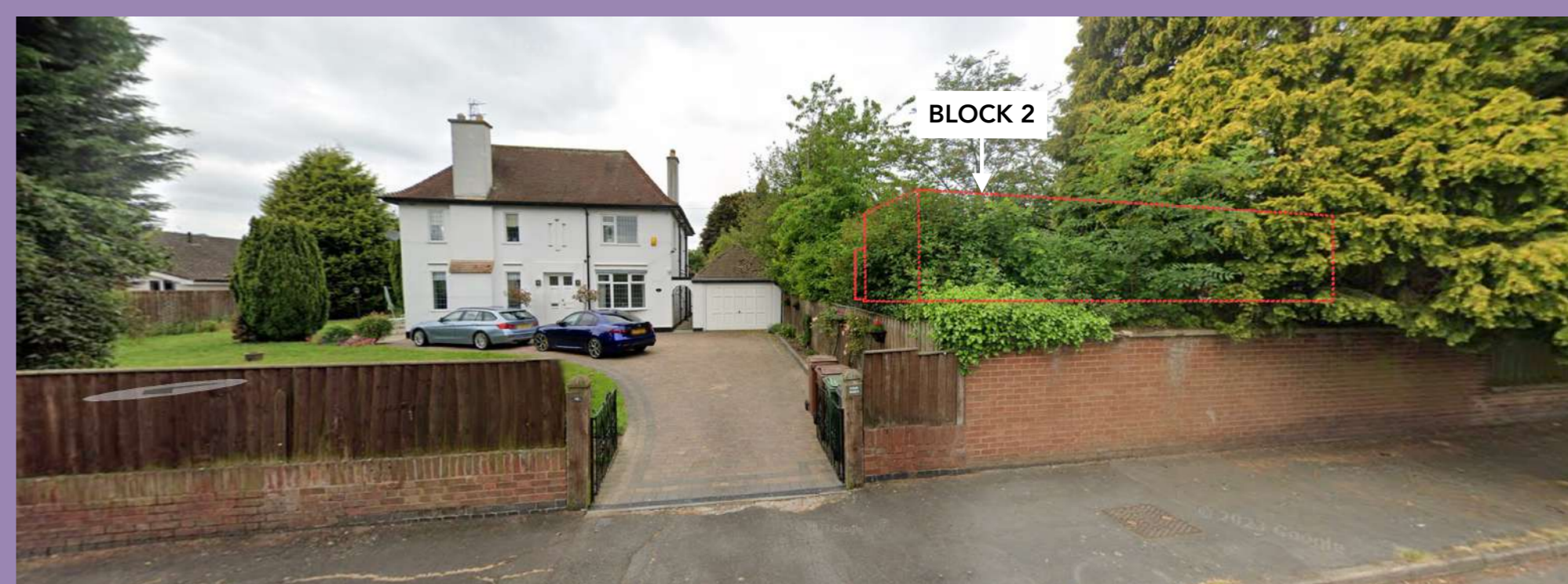
View from 6 Holywell Drive