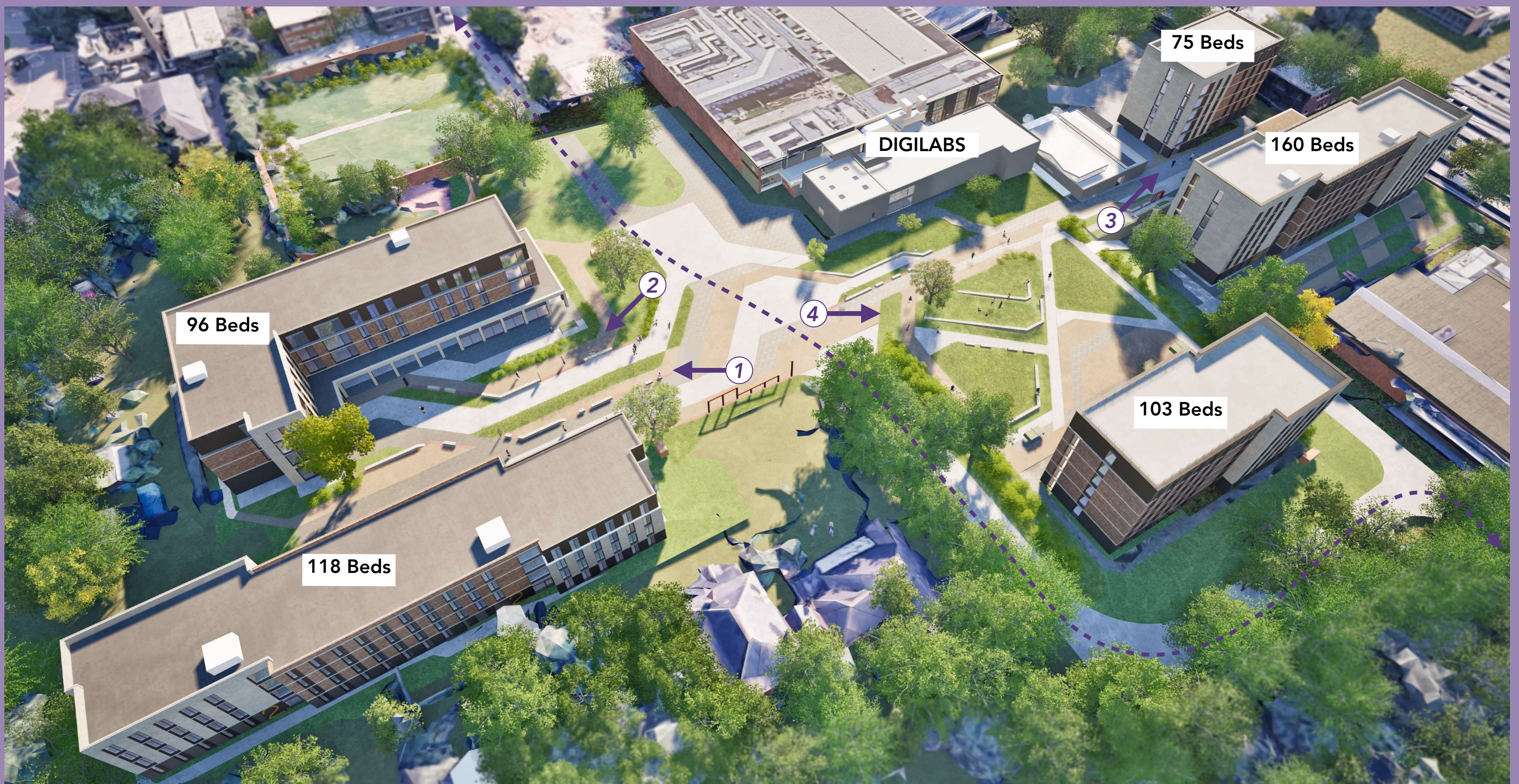
Proposed Site Aerial - Layout of the proposed buildings

The sketch visuals show how the proposed buildings would appear in views taken from above the site.