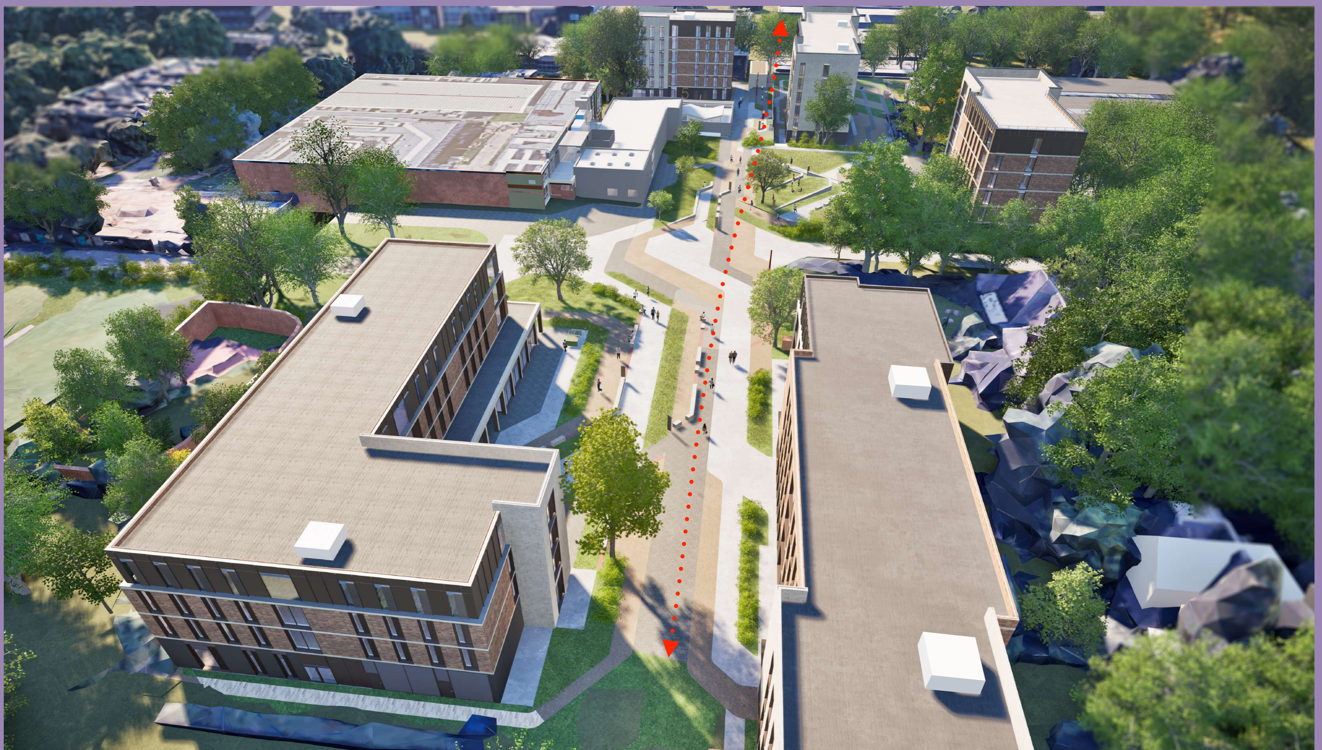
Proposed Site Aerial - Main Pedestrian Route looking East