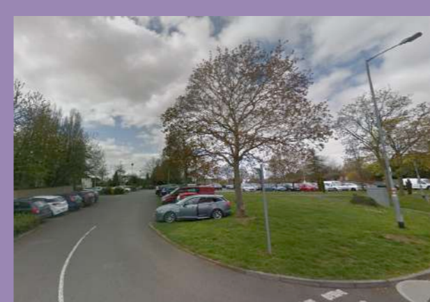
4 View across car park from the NE.