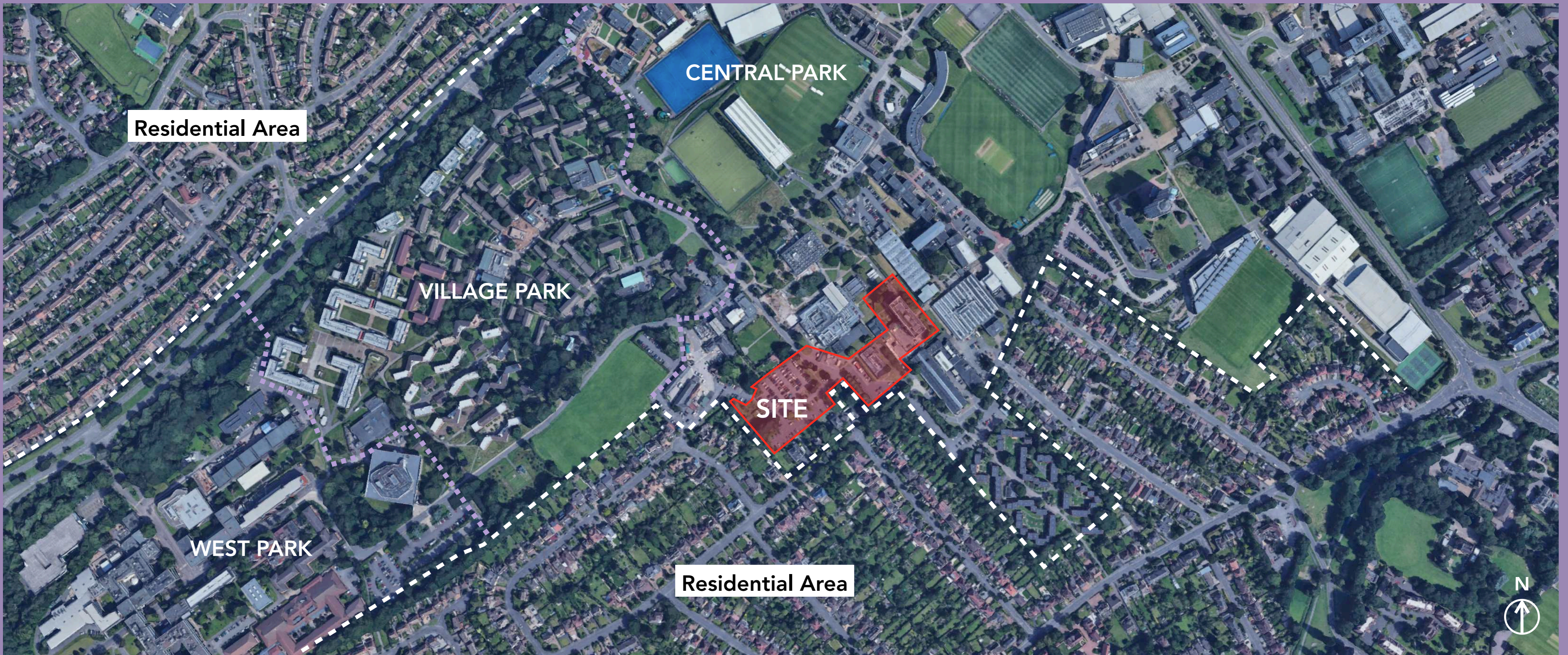
Site Location - approximate red-line boundary