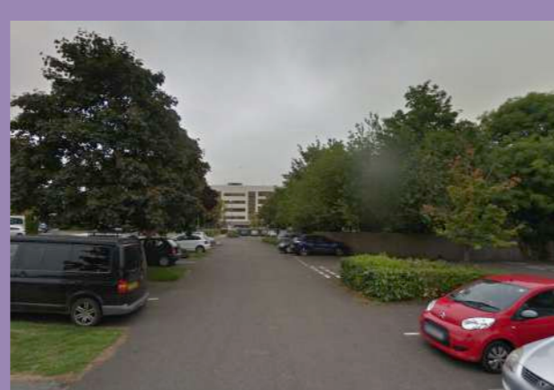
3 View across car park looking towards the Chemistry Block.