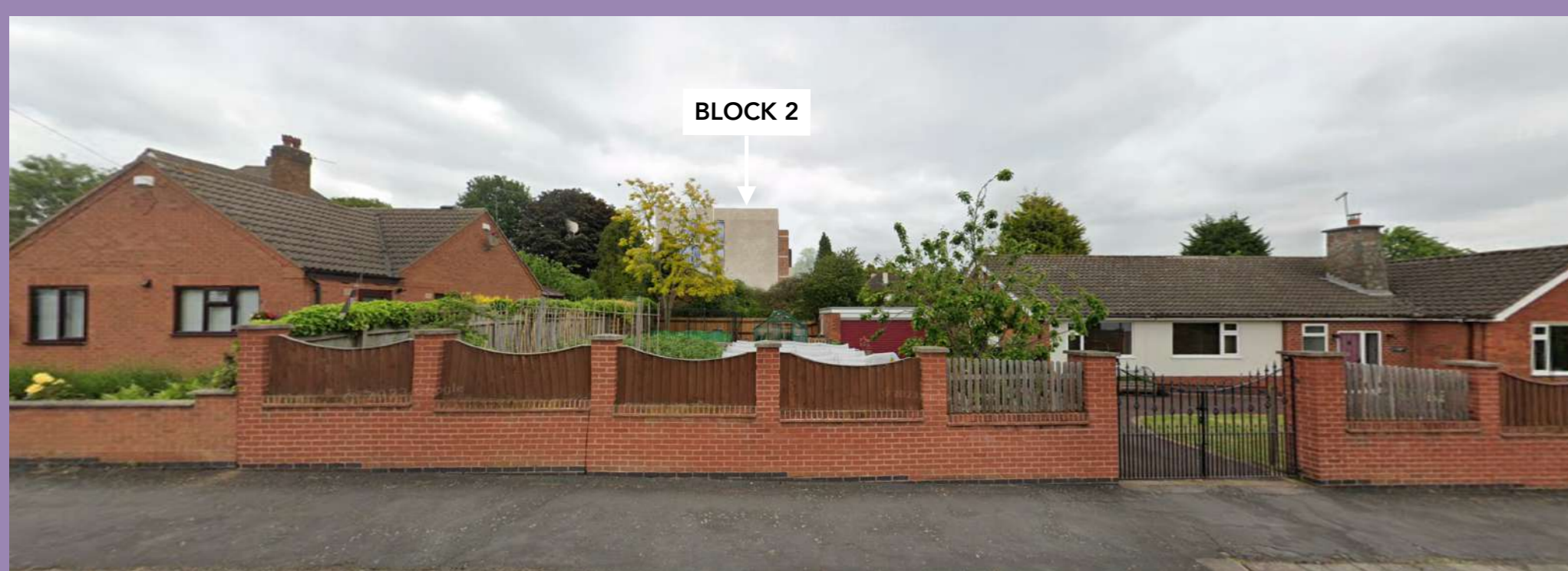
View from 17 Spinney Hill Drive