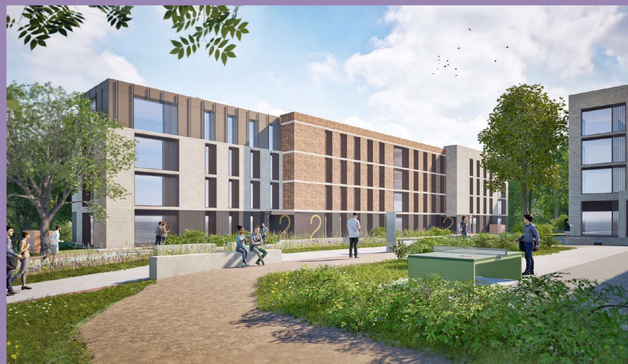
2 Block 2