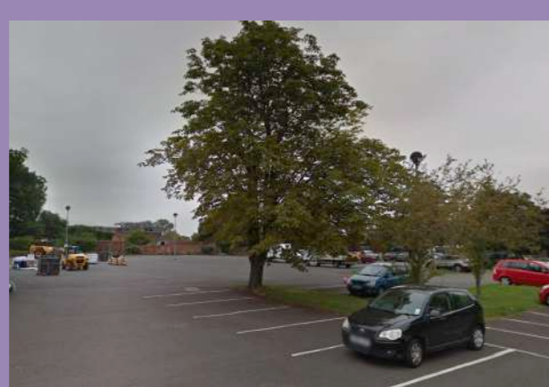
2 View across car park looking towards the Walled Garden.