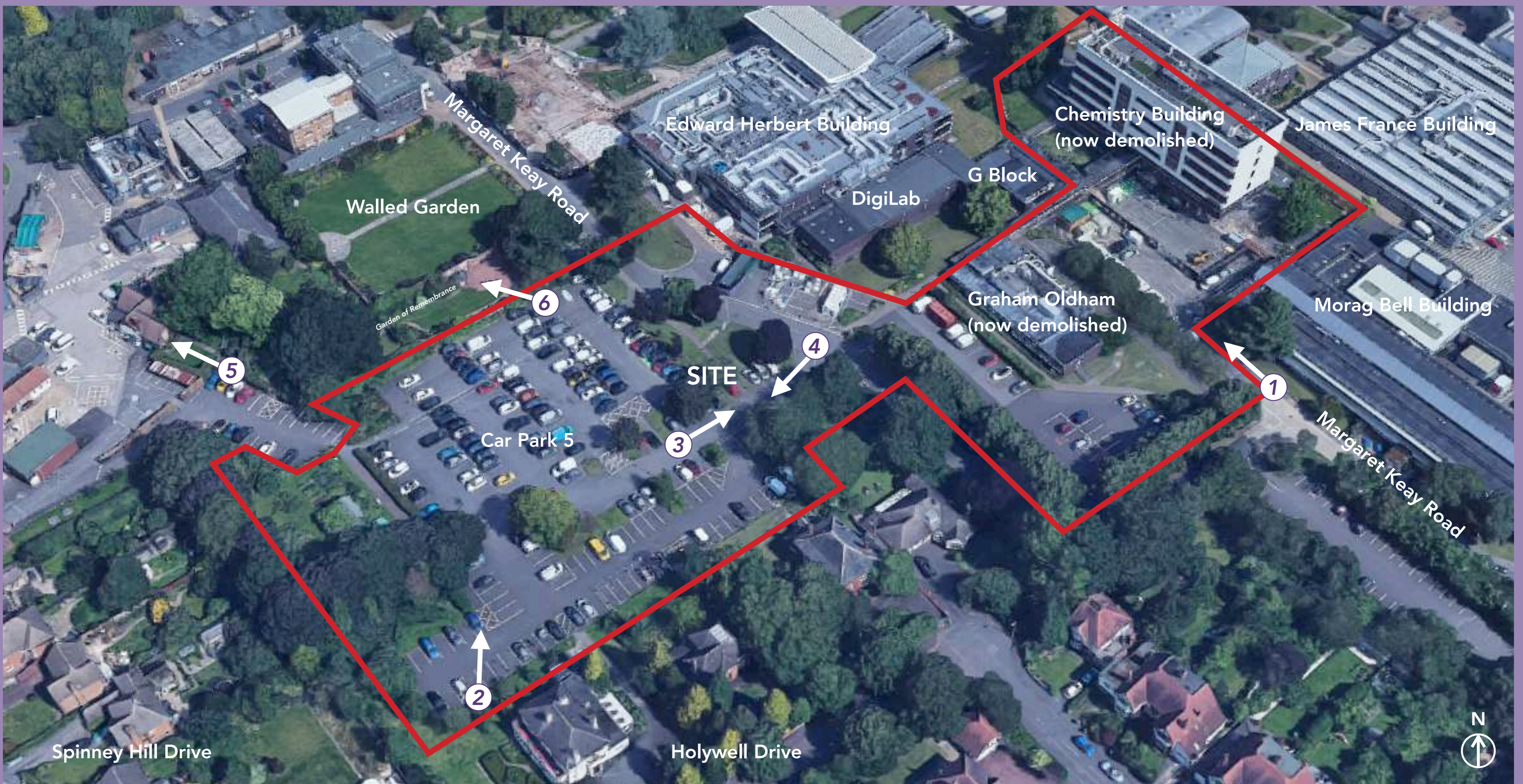
Existing Site Aerial View