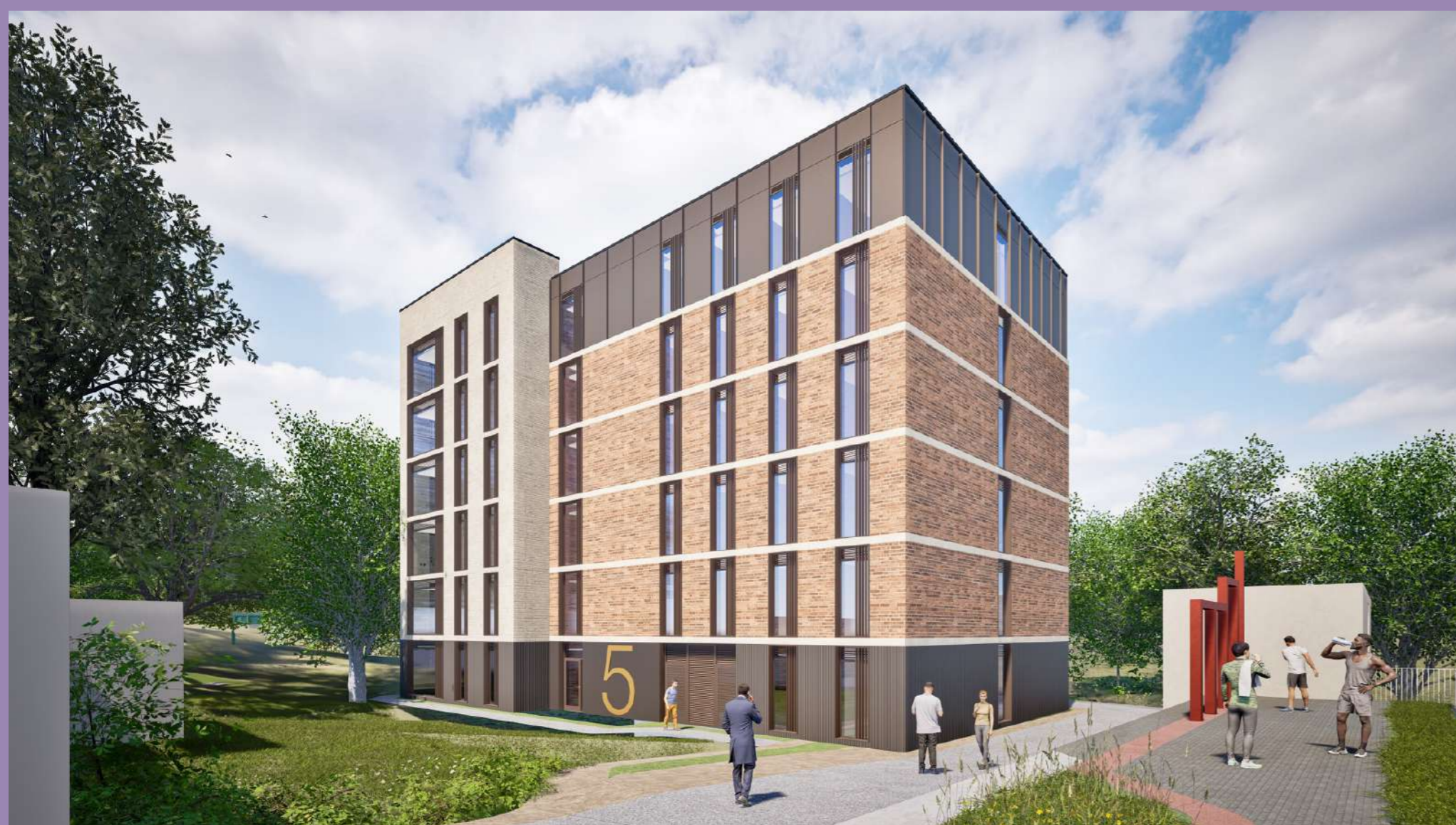
3 Block 5