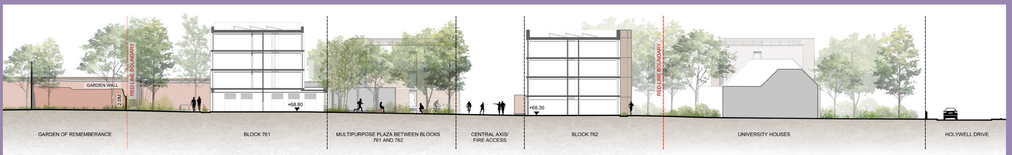
Section B-B - cutting through blocks 761 and 762, from the Walled Garden to Holywell Drive.