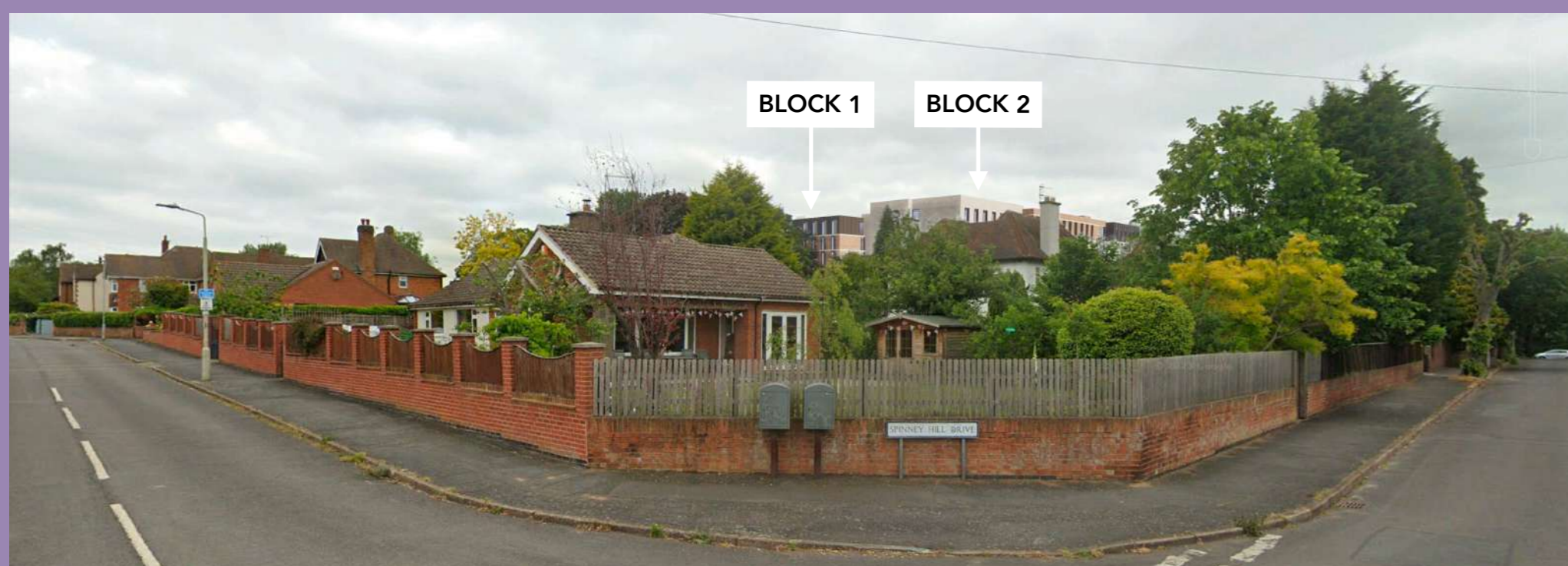
View from the Spinney Hill Drive - Holywell Drive junction