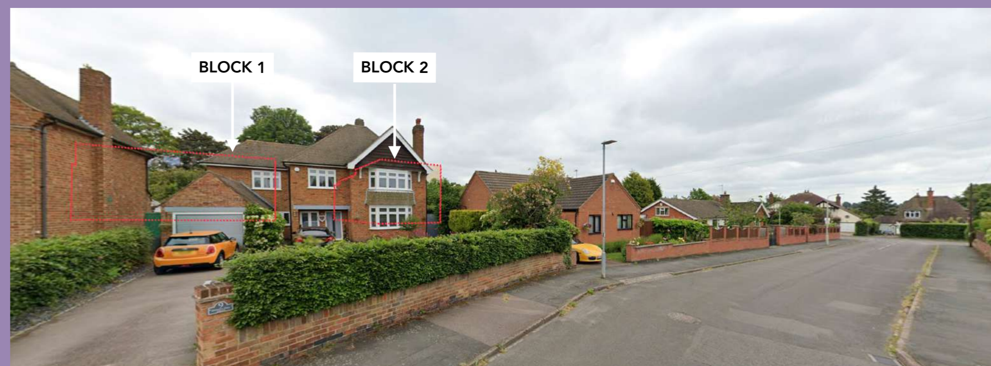
View from 9 Spinney Hill Drive