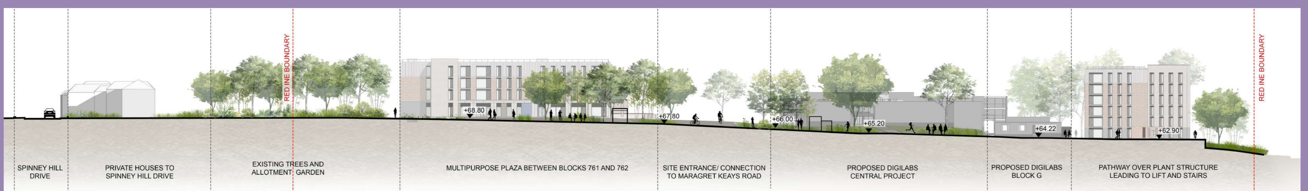
Section A-A - along the main pedestrian axis, between blocks 761 and 762.