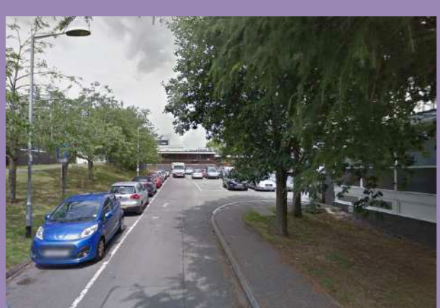
1 View along Margaret Keay Rd looking towards G Block.