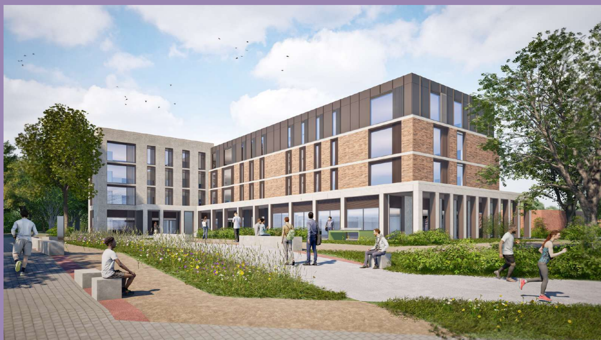
1 Block 1

For example, the blocks nearest to the existing University uses such as Morag Bell Building and Wavy Top will be 6 storeys whereas the blocks closest to the Walled Garden, Garden of Remembrance and established residential areas to the south east and south west of the site will not exceed 4 storeys in height.