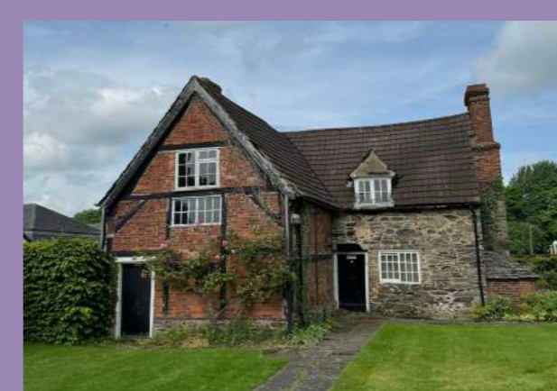
5 The Gardener's Cottage