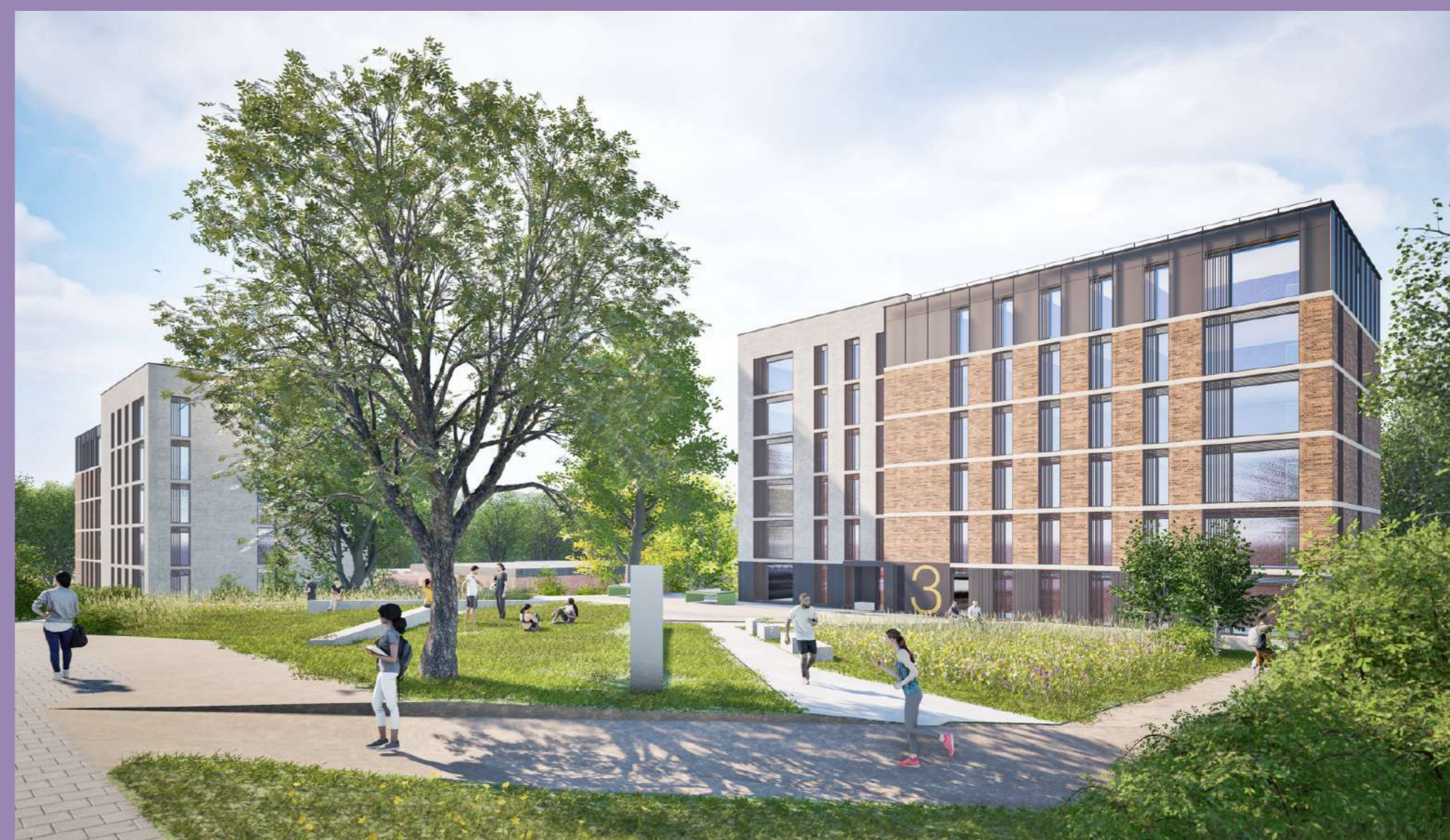
4 Block 3 with Block 4 beyond