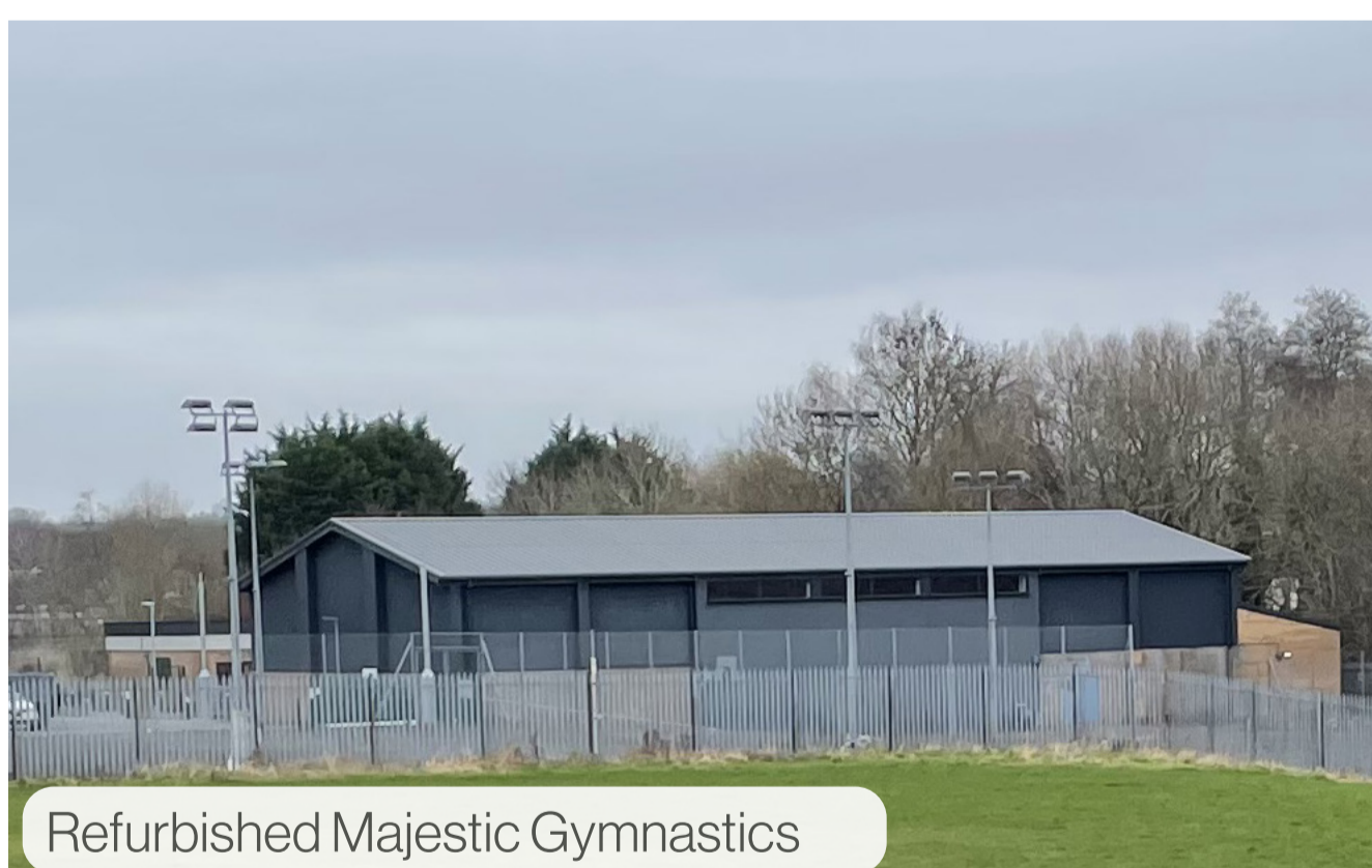
Refurbished Majestic Gymnastics