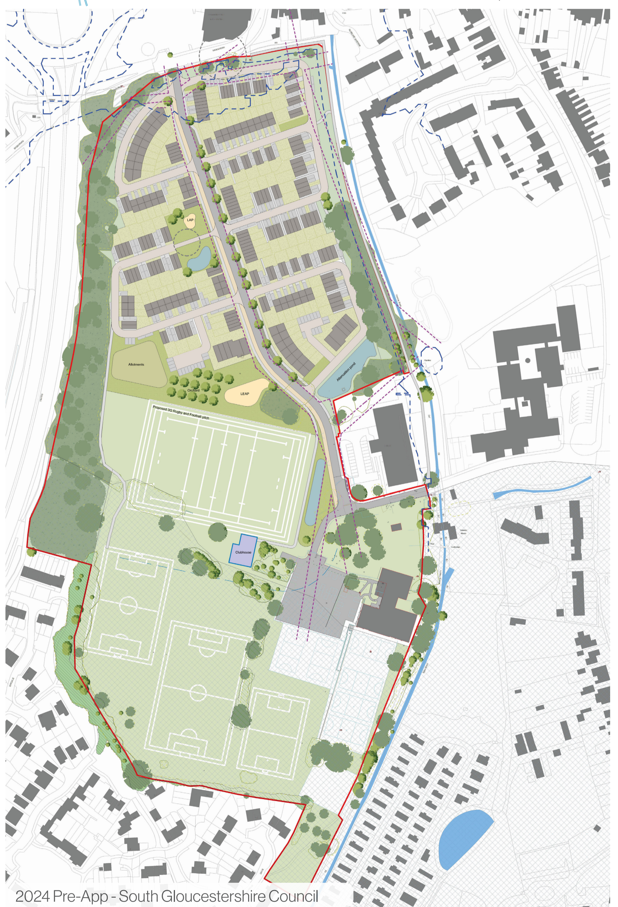
2024 Pre-App - South Gloucestershire Council