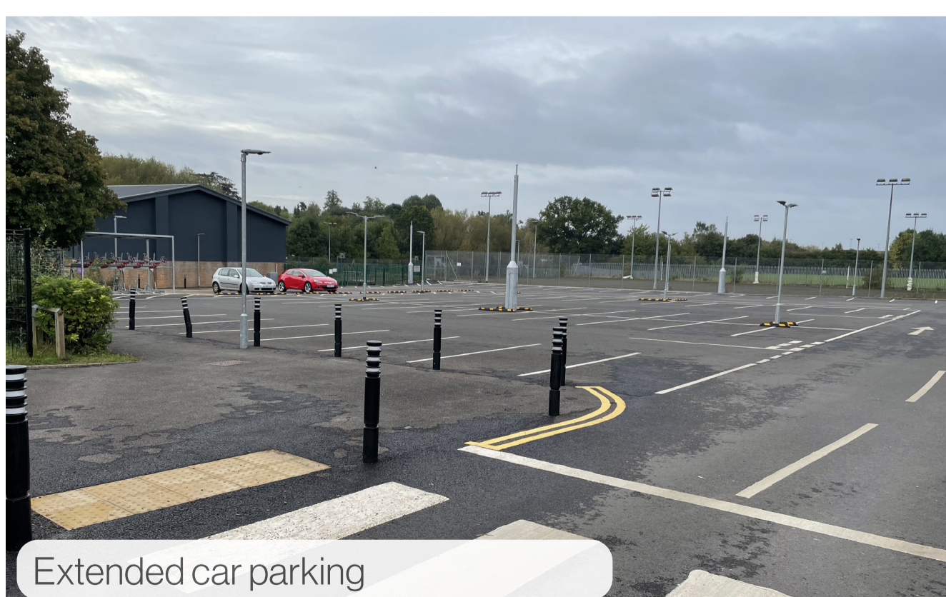
Extended car parking