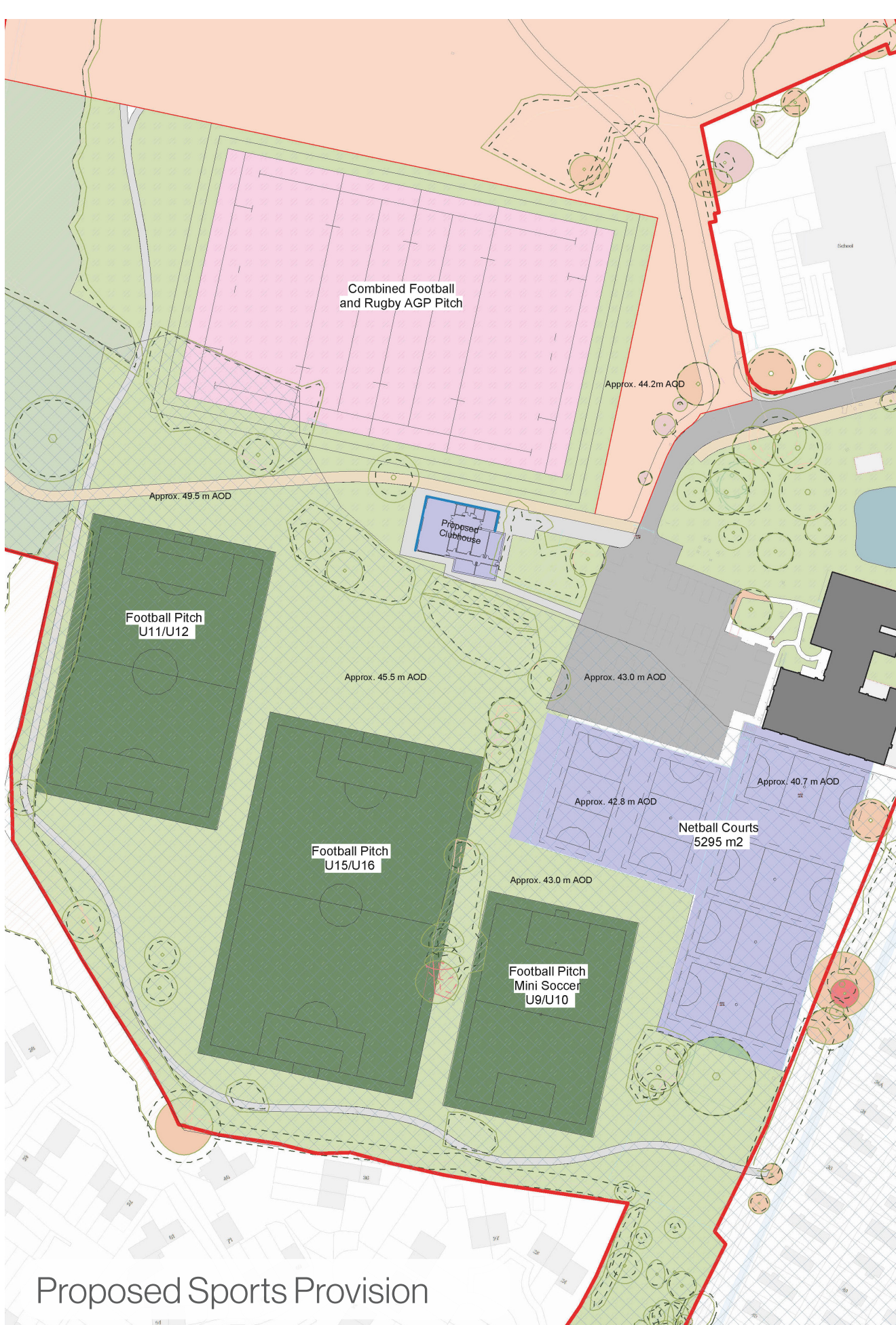
Proposed Sports Provision