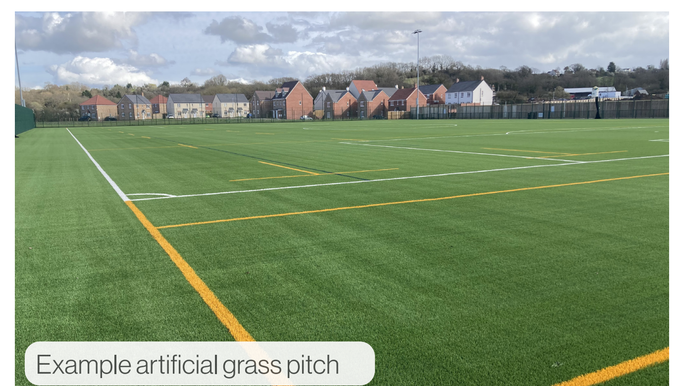
Example artificial grass pitch