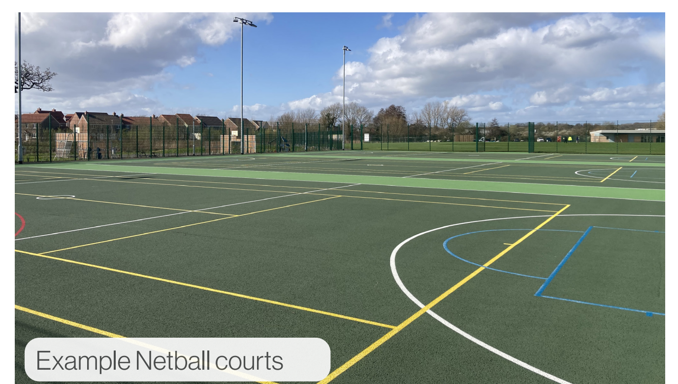
Example Netball courts