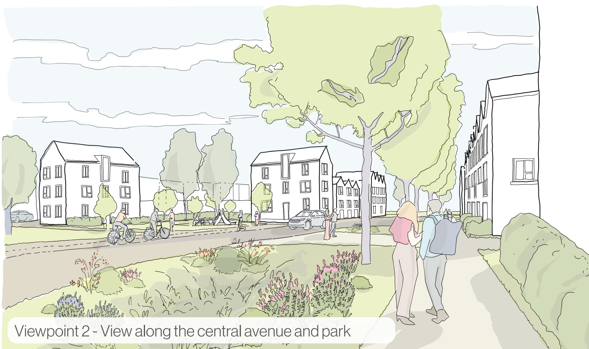
Viewpoint 2 - View along the central avenue and park