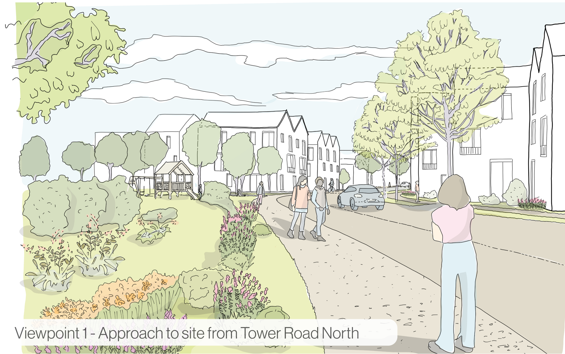
Viewpoint 1 - Approach to site from Tower Road North